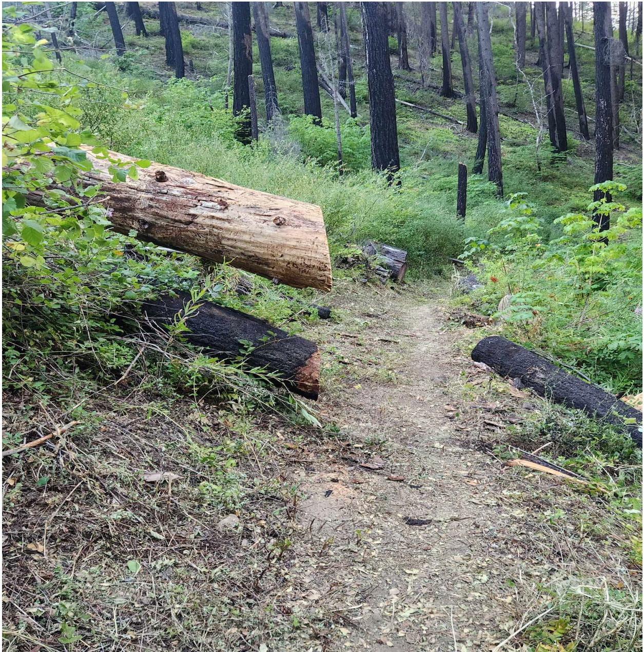
Figure 7: A very problematic log that we need additional bucking. As of 7/15/2024 this section accommodates pedestrian/bike/equestrian passage.