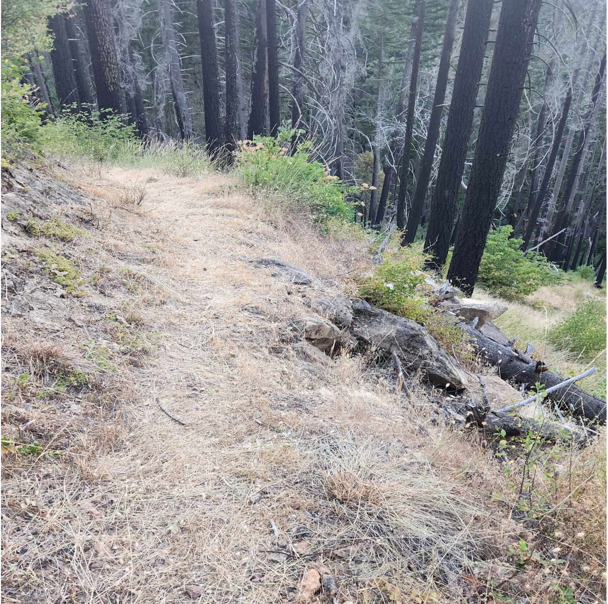
Figure 4: Slide area that could use a new retaining or crib wall. The tread is stable at this time, but it is imperative to fix this issue prior to the wet season.