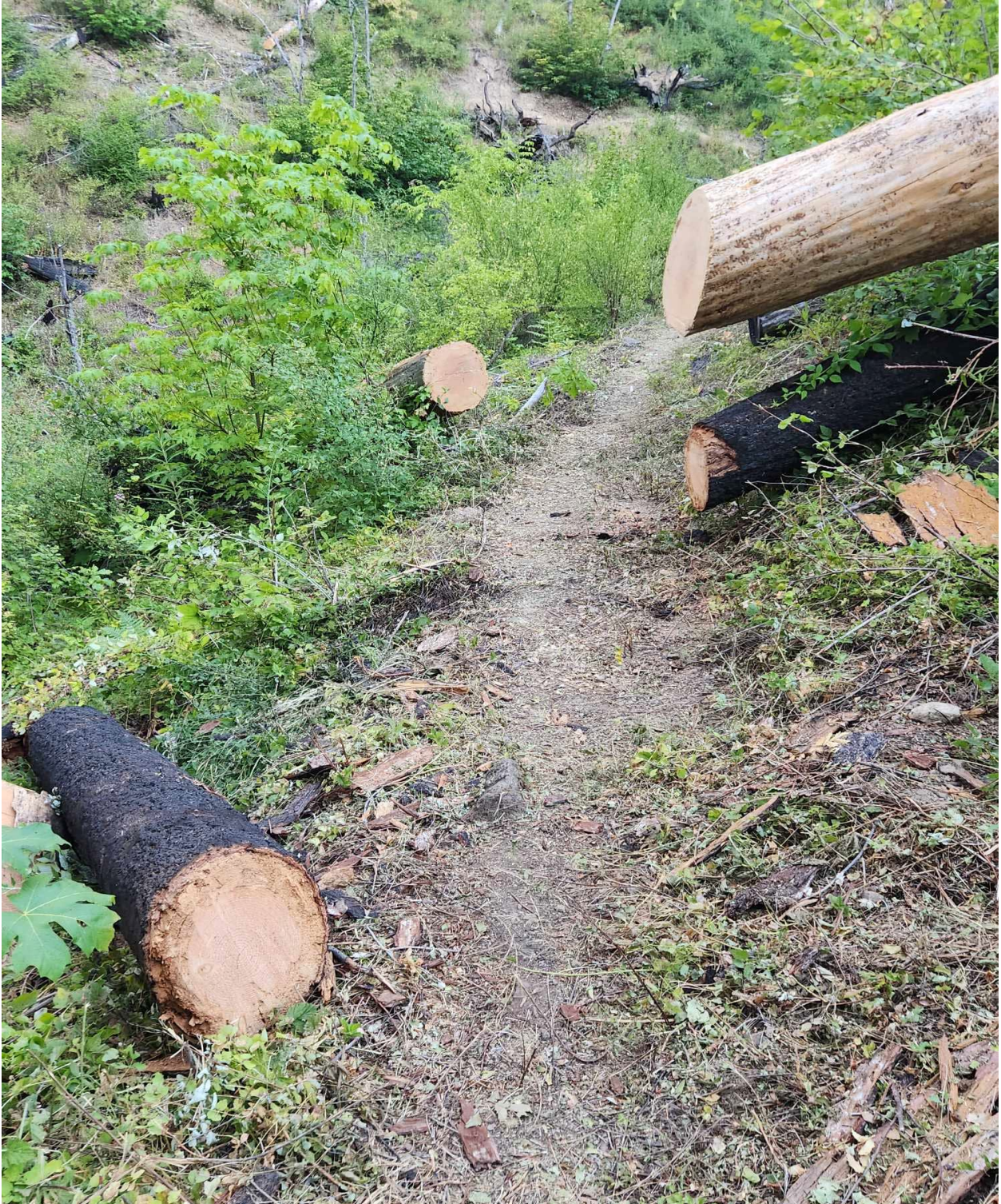
Figure 8: Another view of the hazard tree that can be found in the powerline ROW.