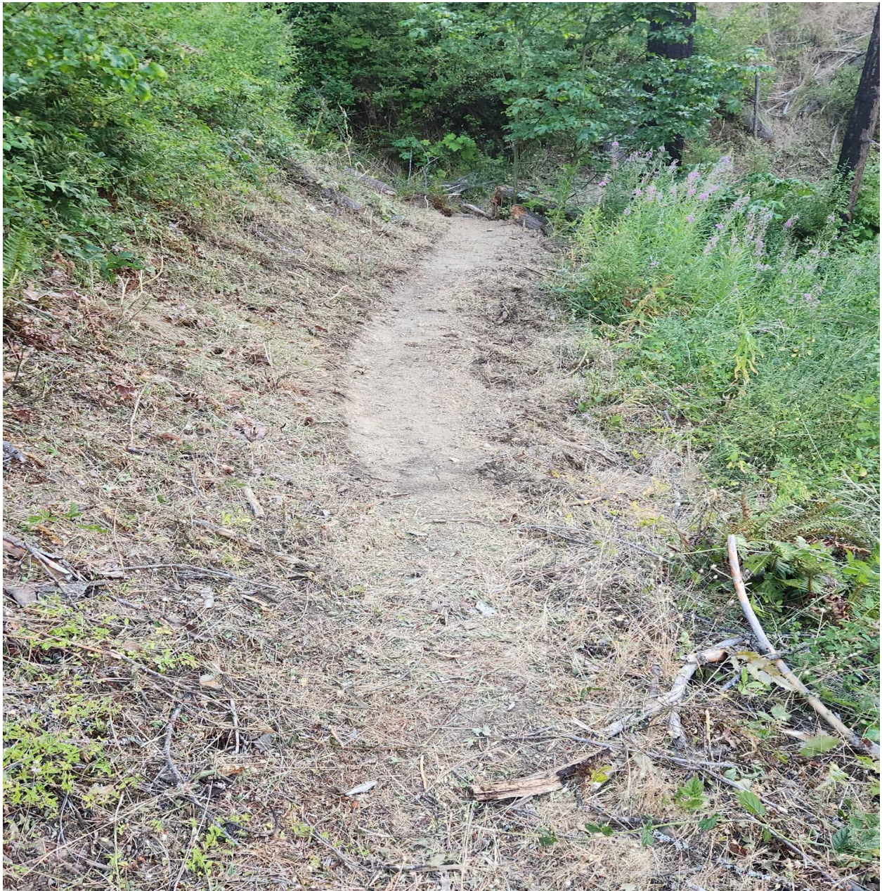
Figure 5: Newly cut tread (30') leading up to the first drainage crossing.