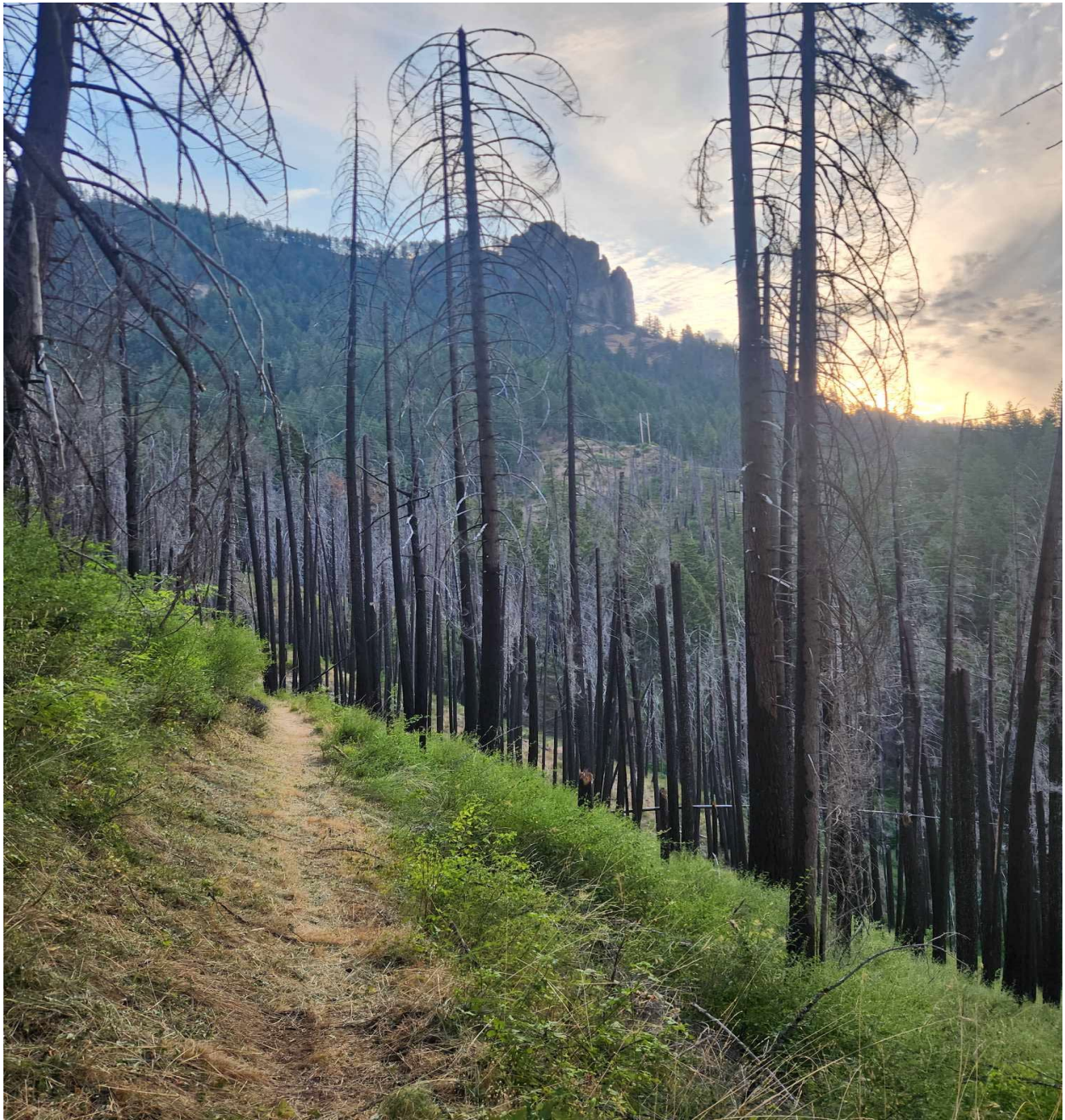
Figure 3: Illahee Flats Trail. Photo taken just after brush work completed on 7/13/2024.