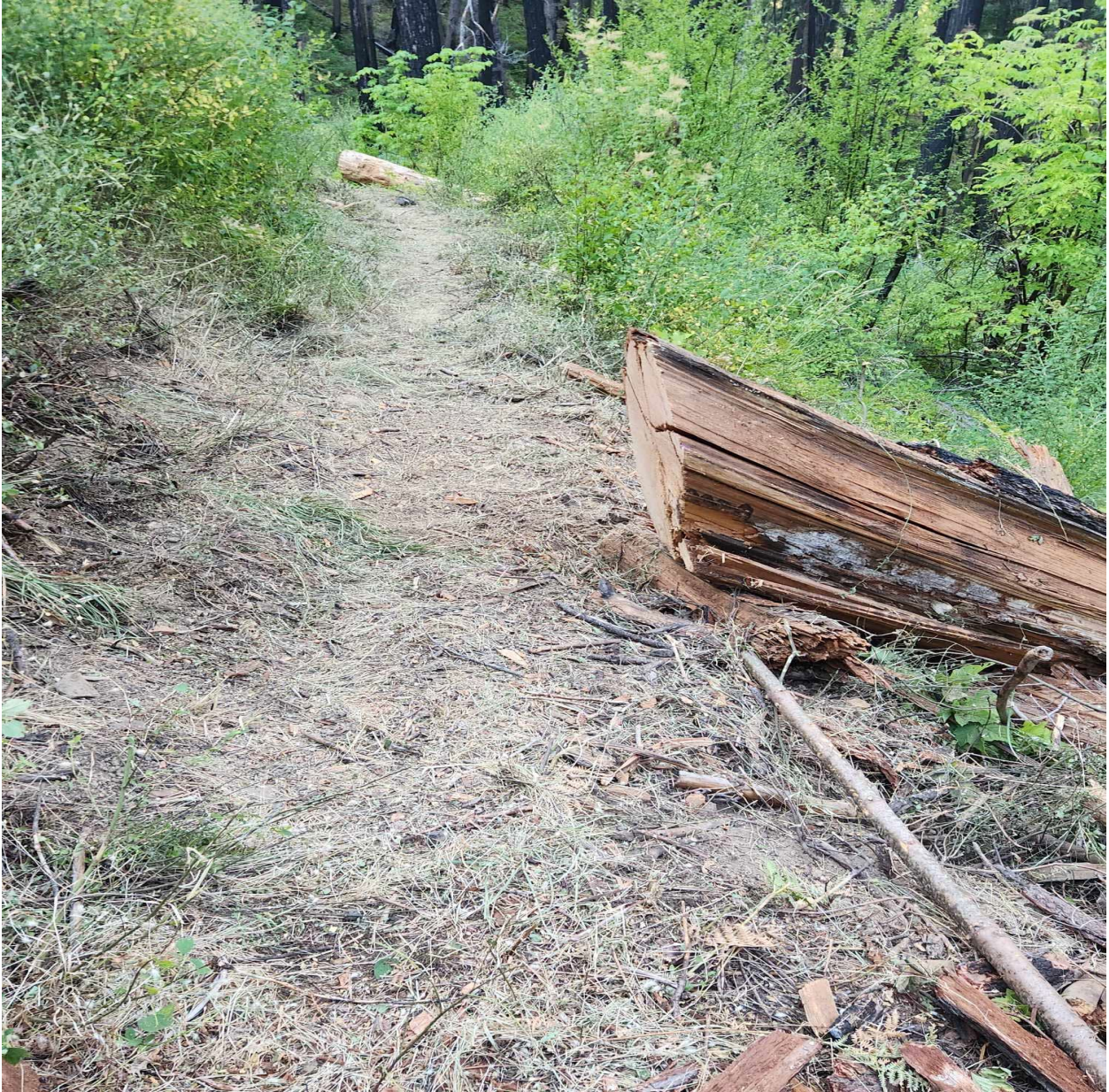
Figure 6: One of four logs bucked on 7/13/2024. This area is located directly below the powerline ROW. It is anticipated that this area will need consistent maintenance for several years to come.