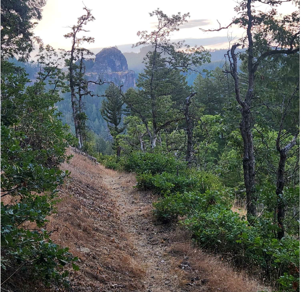
Figure 1: Completed brush work at .25-mile marker.